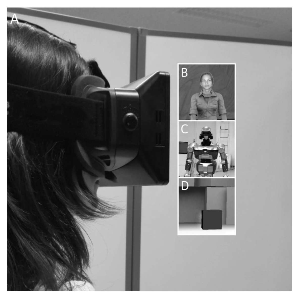
Figure 1. Mediated embodiment process. Users wear a head-mounted display (A) which provides first-person audiovisual perspective from the avatar body and blocks vision from the physical world. Users embody an avatar in virtual reality (B) or in a physical environment (C) and experience its body and its surroundings in first person. Avatars can also be non-anthropomorphic living beings or objects (D).

2013; Aymerich-Franch et al., 2015, 2016a, 2016b; Cohen et al., 2012, 2014; Kishore et al., 2014; Nishio et al., 2012). Auditory feedback is implemented with the use of headsets or speakers and haptic feedback can be implemented with the aid of different sort of haptic devices that facilitate grasping and moving objects, experiencing a texture, or receiving force feedback (Fox et al., 2009; Stone, 2001).